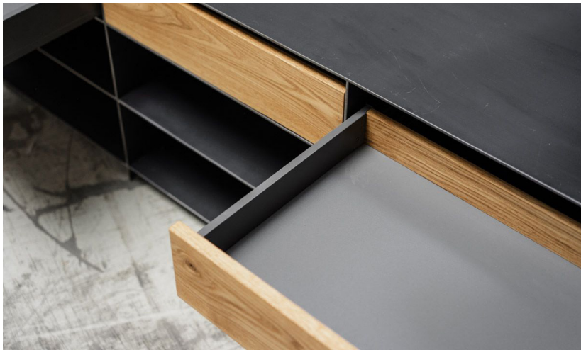
senosan® A48 SOFTFEEL 0001 embossing: 022HT